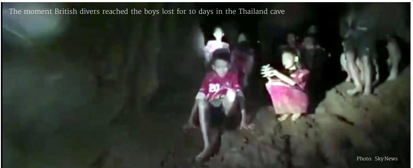
The moment British divers reached the boys lost for 10 days in the Thailand cave

Firstly, it might remind us of the blessing and benefit of work. Those Psalms remind us that it is a truly divine and noble task to contain the harmful influence of the waters and protect those in peril at their rising. Sure, many of those international divers described what they do as a hobby; a way in which, as cave divers, they are always there for one another. But the equipment that they used, the logistics needed to get it all in place and the processes of organisation and planning to make it all happen are all the fruits of human enterprise. If work is a sacrament, then here is one example that