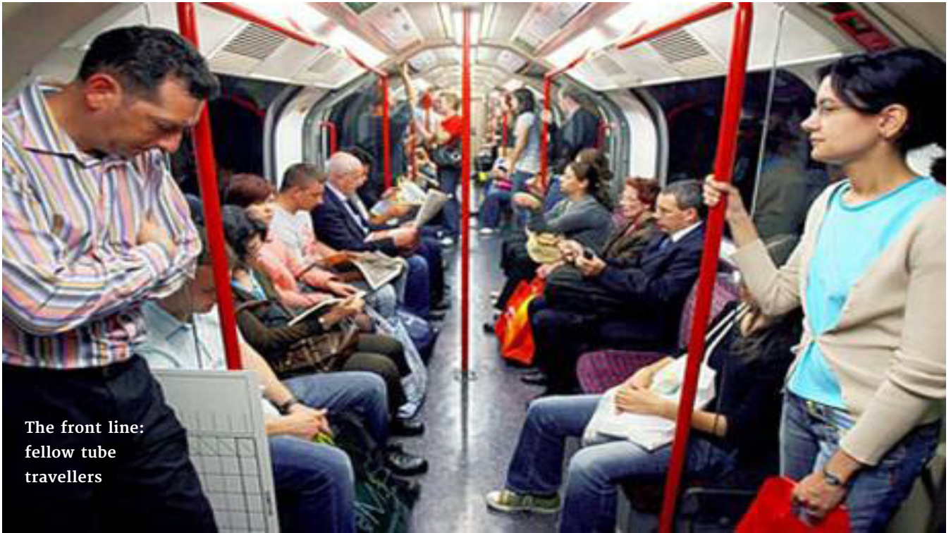
The front line: fellow tube travellers

Sovereign over all, does not cry, Mine!" Greene shows how the Spirit is at work in every follower of Jesus in this great story of rescue and transformation in and through the concrete detail of their life and because their life is in him.